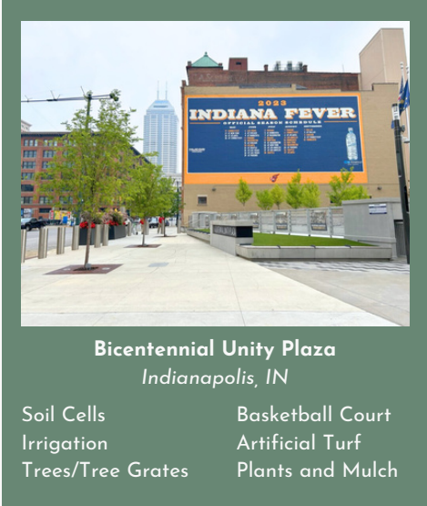
Bicentennial Unity Plaza Indianapolis, IN