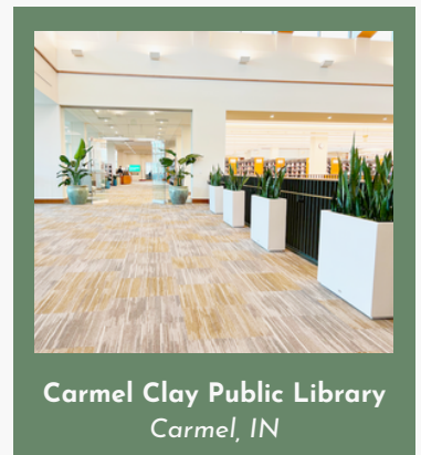
Carmel Clay Public Library Carmel, IN

Where greenery is desired in a space that may be difficult to maintain, replica greenery is the perfect solution. From greenwalls to plantscapes, faux greenery looks very lifelike and creates an affordable, maintenance-free biophilic design enhancement.