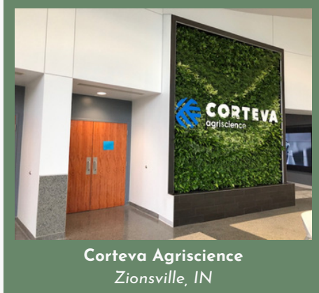
Corteva Agriscience Zionsville, IN

Preserved moss walls are a maintenance-free interior design element that adds life to any space without the need for light, watering or special attention. Its acoustic properties can be incorporated into ceilings and walls or combined with other natural elements such as preserved plants, wood, stone, or logos. Design possibilities are limitless.