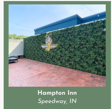
Hampton Inn Speedway, IN