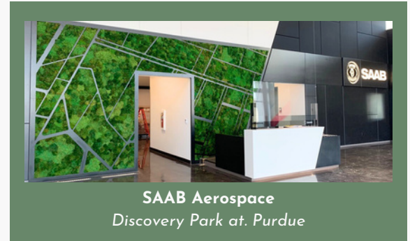
SAAB Aerospace Discovery Park at Purdue

"Crossroads of America" - the theme behind this living wall for the Global Economic Summit. From Instagram-worthy back drops to planters and plants that enhance meeting spaces, our team designs around your budget, installs and maintains the plants for the duration of the event.