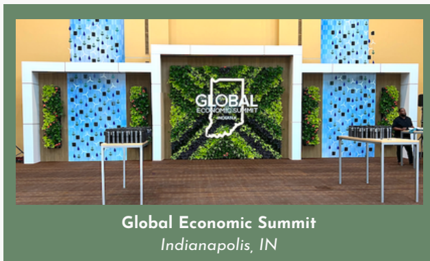
Global Economic Summit Indianapolis, IN