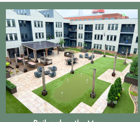
Railyard on the Monon Carmel, IN

Turf & Putting Green Irrigation Maintenance Landscaping